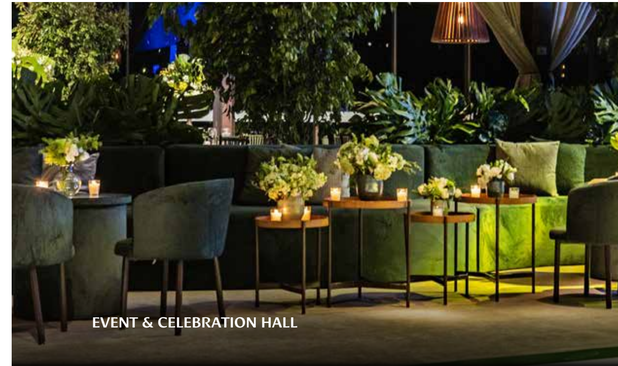
EVENT & CELEBRATION HALL

Meet the Luxe Community Oasis— the cool hangout spot for our community that brings you an elevated lifestyle with state-of-the-art amenities and engaging activities.