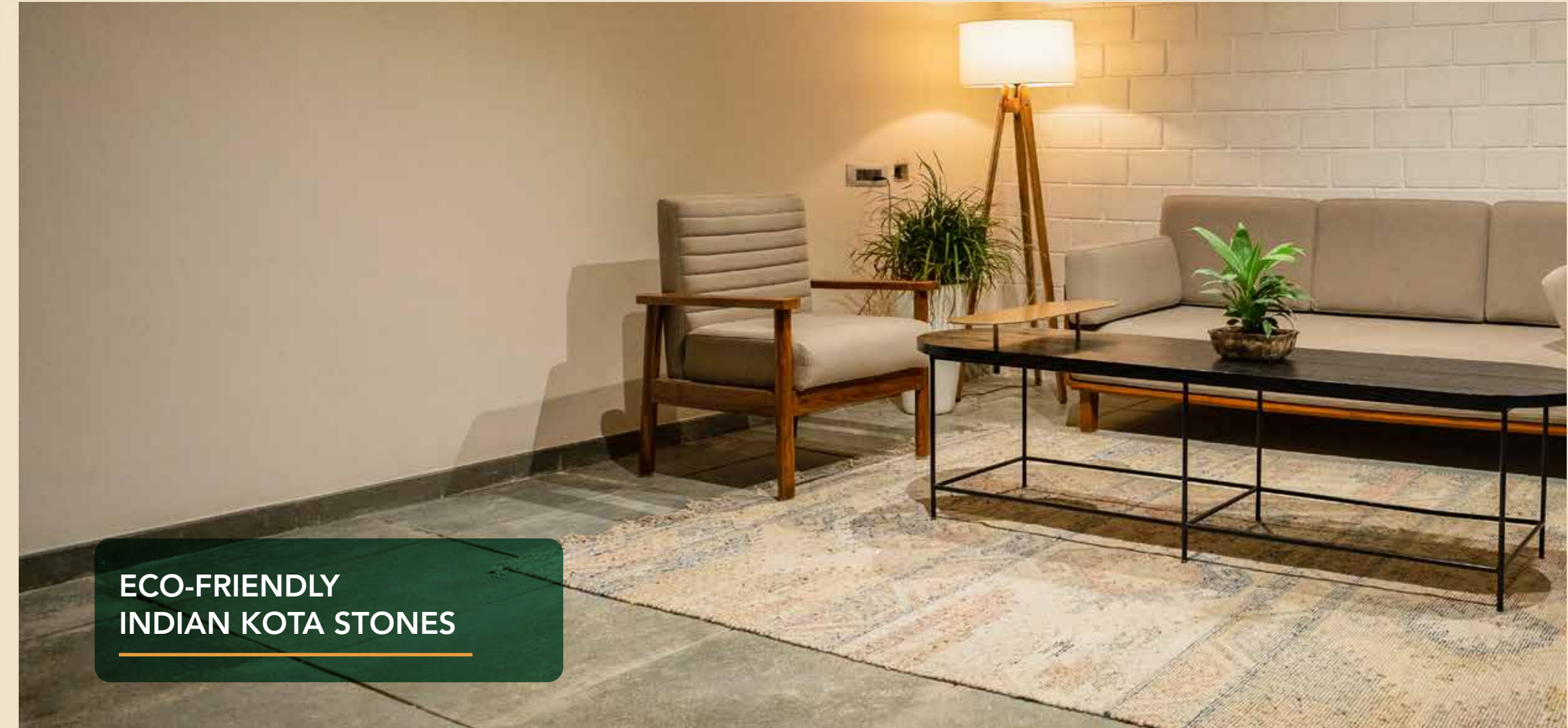
ECO-FRIENDLY INDIAN KOTA STONES