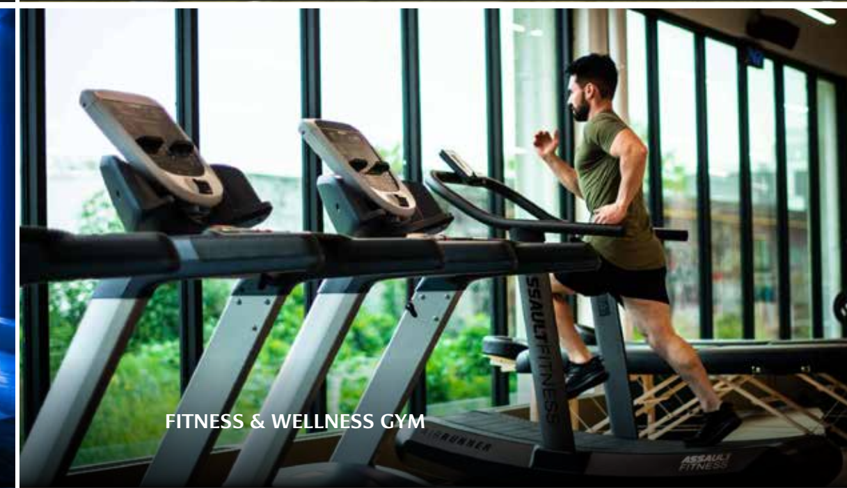
FITNESS & WELLNESS GYM