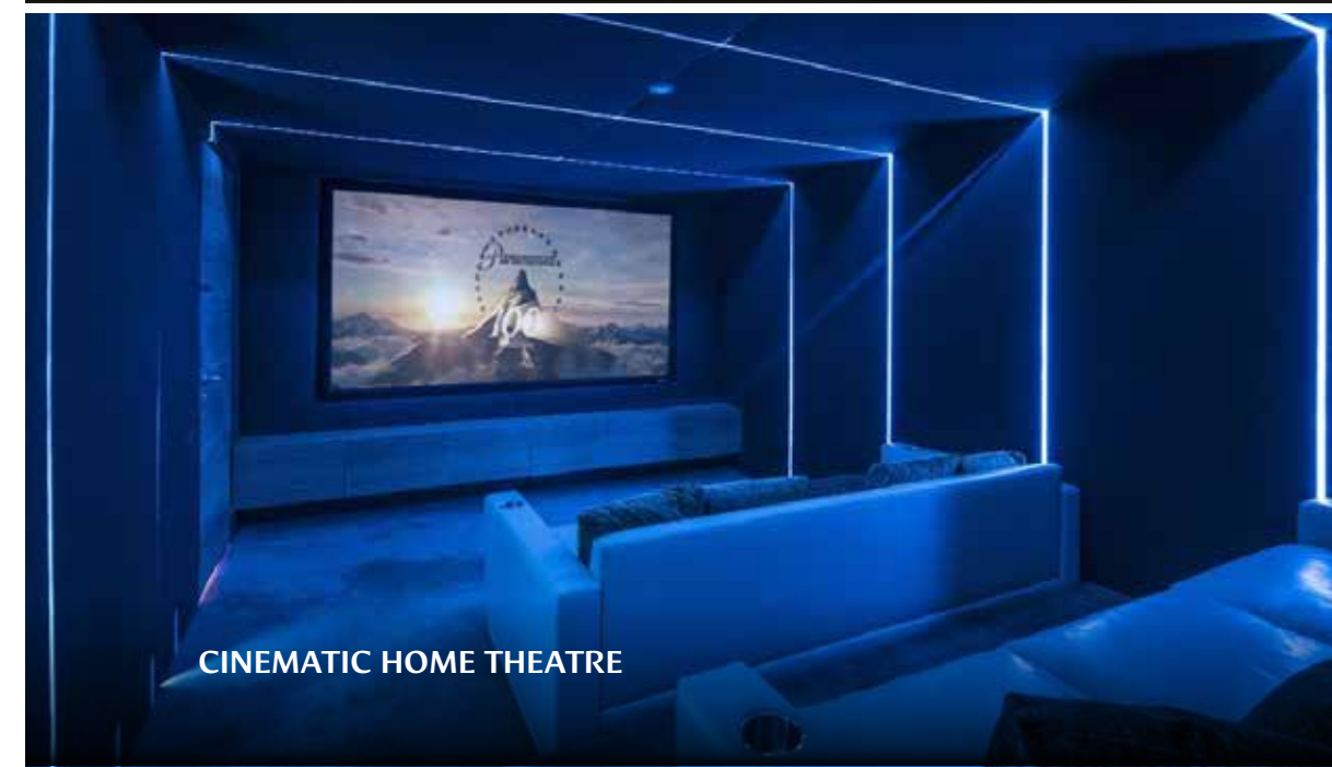
CINEMATIC HOME THEATRE