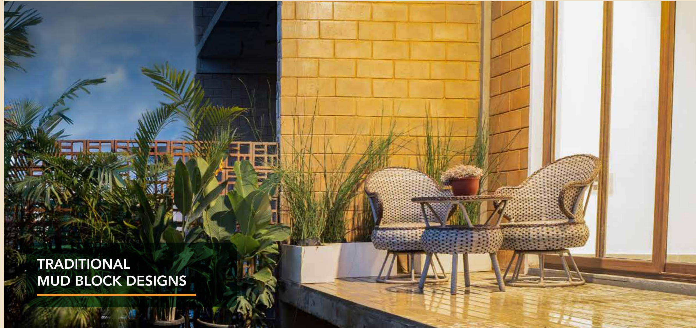
TRADITIONAL MUD BLOCK DESIGNS